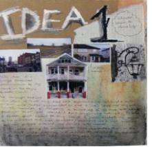
Photos of what you plan to Base your design idea/composition on with annotations