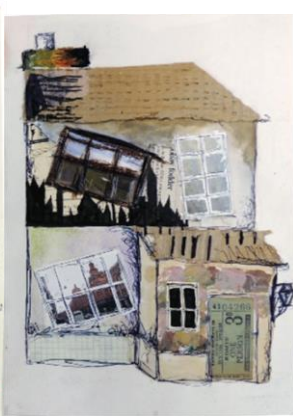
A small version of what you want you idea to be like using the media You plan to use. Here you can also annotate WWW & EBI