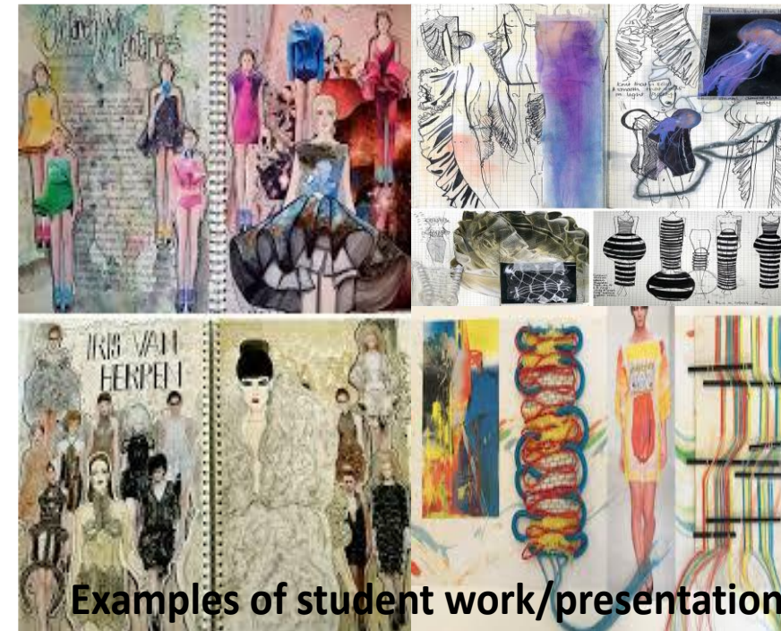
Examples of student work/presentation