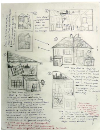
Sketches of the images you are using With annotation to describe your thoughts And the media you plan to use