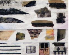
Samples of media you plan to use These must relate to this design