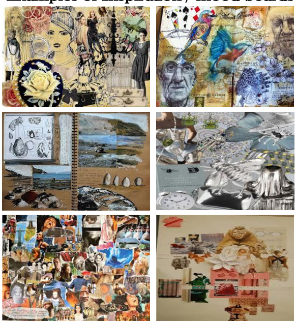
A mood board is a page of overlapping images